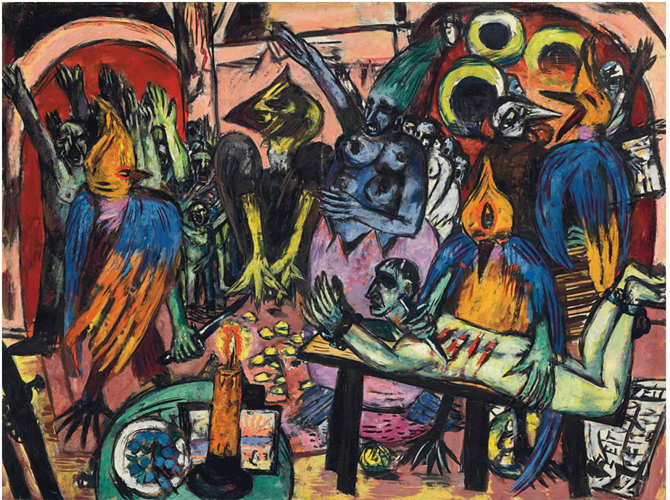
Max Beckmann, Hölle der Vögel, 1937-38.

It is in the interest of the bourgeoisie to destroy any working-class and peasant project. This can be done by the use of violence, the law, and by the swindle of fulfilment, namely the creation of aspirations within capitalism that destroy the political platform for a post-capitalist society. Parties of the working-class and peasantry are mocked for their failure to produce a utopia within the boundaries of capitalism; they are mocked for their projects which are said to be unrealistic. The swindle of fulfilment, the gothic dreams, are seen as realistic, whereas the necessity of socialism is portrayed as unrealistic.