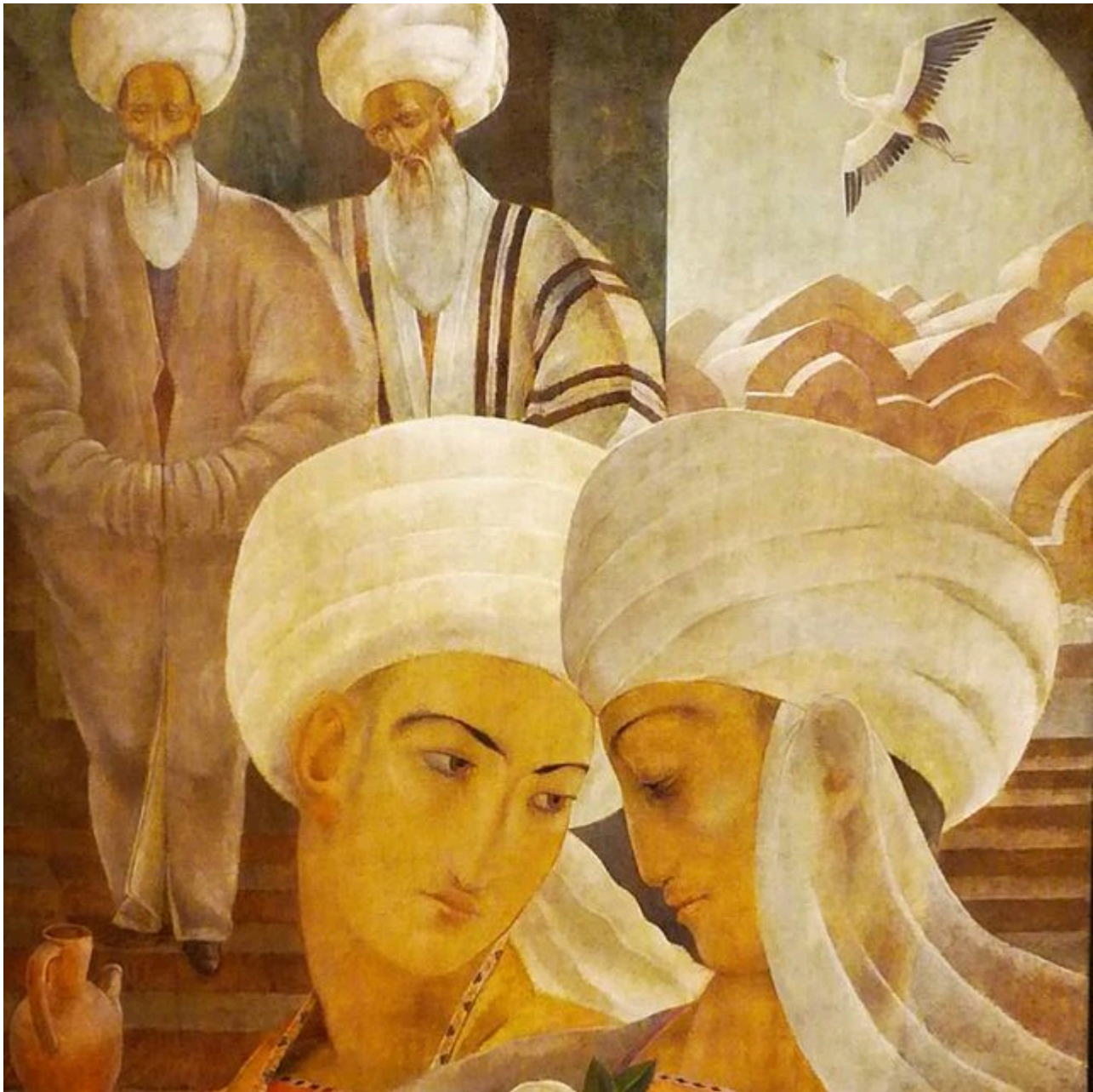
Alexander Nikolaev, also known as Usto Mumin (Soviet Union), Friendship, Love, Eternity , 1928.